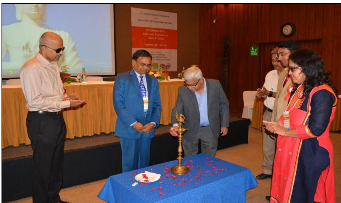
Lighting the Lamp