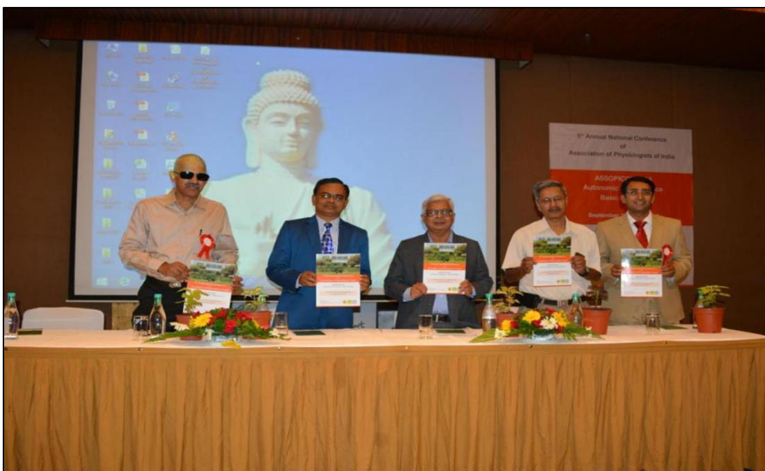
Inauguration of Conference Souvenir

5 th Annual National Conference of Association of Physiologists of India was well attended, informative and energizing. The gathering allowed for dissemination of ideas, newer research trends, panel discussion, and general shared discussion among all attendees. The conference post-survey was very positive, indicating a successful meeting and strong desire among the group to meet again.