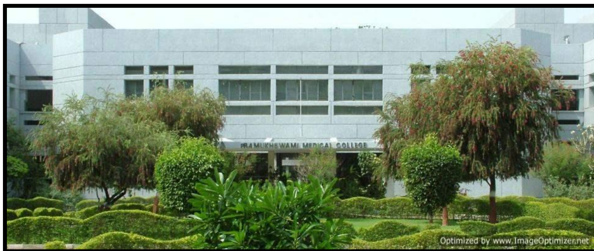
A view of PSMC, Karamsad.

Association of Physiologists of India (ASSOPI) is the exclusive Association of Physiologists meant for advancement of Physiology in order to explore the highest possibilities of Physiologists in general. The association aims at establishing excellence in research and teaching in the field of Physiology. The mission of ASSOPI is to integrate and facilitate the knowledge and principle of Physiology for clinical practice in patient management and to deliver excellence in the field of medical research and Medical Education.